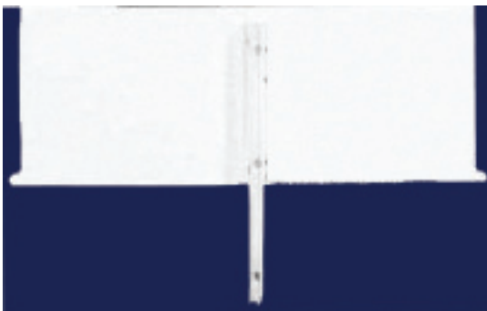
The type of folder you should use for your application is pictured above.

Make life easier for the judges. When you're finished, do not staple or use paperclips on any part of your application. Do not use plastic sleeves to protect the pages. Simply place it, as instructed, in a folder.